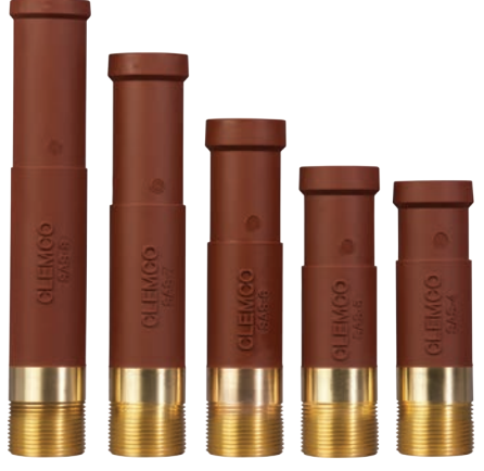
Brass 1-1/4" Thread