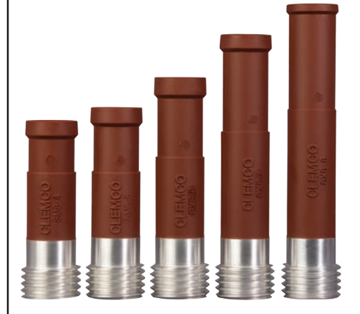
Aluminum Contractor Thread

• Long-venturi nozzles allow high production blasting at a distance of 18 to 24 inches for hard-to-clean surfaces, and 30 to 36 inches for loose paint and soft surfaces