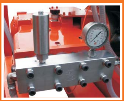
Stainless steel pump-head*.