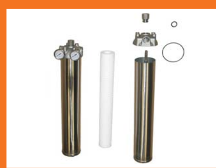
Strainers & Filtration.