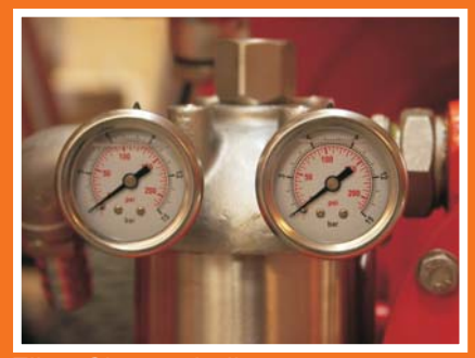
Filter Change Indicators.