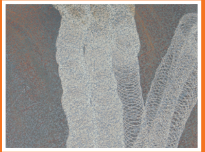
Water Blasting With Rotating Nozzles.