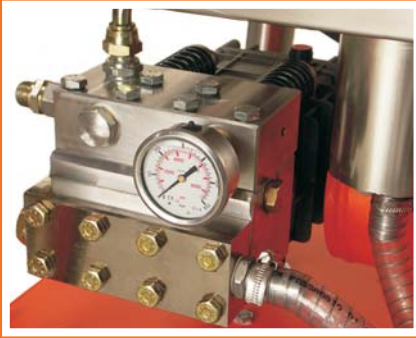
Stainless steel pump-head. Integrated unloader valve.