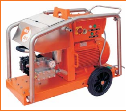
CE20-500 Super Slim