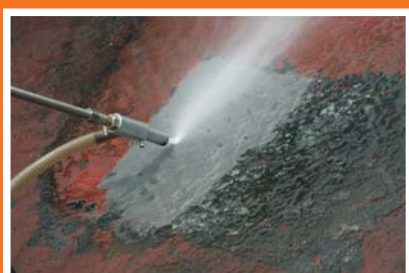
Surface- Sand blasting