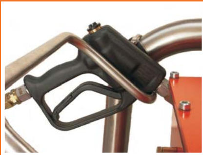
Stainless steel top-frame with gun rest / lance holder.