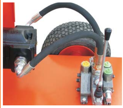
Control valve to pressure line, return line & drain line to tank.