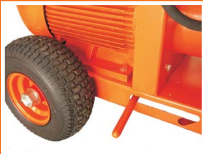
Galvanized frame with built in brake and pneumatic wheels.