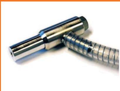
Sand Blasting Equipment