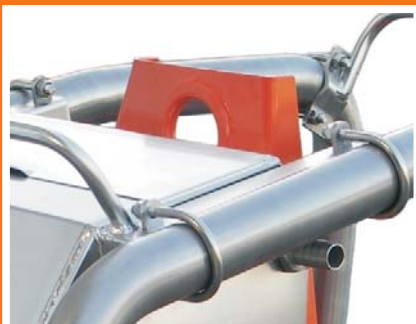
One centralized and balanced lifting eye.