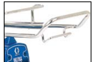
Lo-Boy pail hook for easy bucket movement.