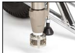
Crush-proof intake screen