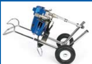
TiltBack cart design (Hi-boy shown).

Comes complete with: New Contractor Gun, RAC X 517 Tip and Guard, 1/4 in x 50 ft (6.4 mm x 15 m) BlueMax II Hose.