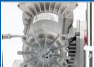
Brushless DC motor with Lifetime Warranty.