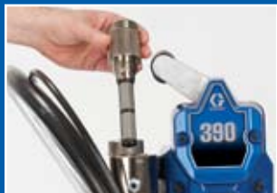
New Easy Out Filter with 8.1 square inches of filtering area.

Comes complete with: New FTX™ Gun, RAC-X 515 Tip and Guard, 1/4 in x 50 ft (6.4 mm x 15 m) BlueMax™ II Hose.