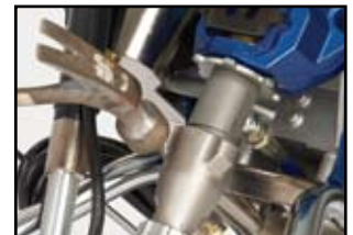
QuikAccess intake requires only a hammer to access the intake ball.