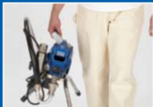
New offset handle is positioned to kick sprayer away from leg while carrying.