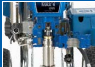
Watchdog Pump Protection System prevents dry pumping damage.