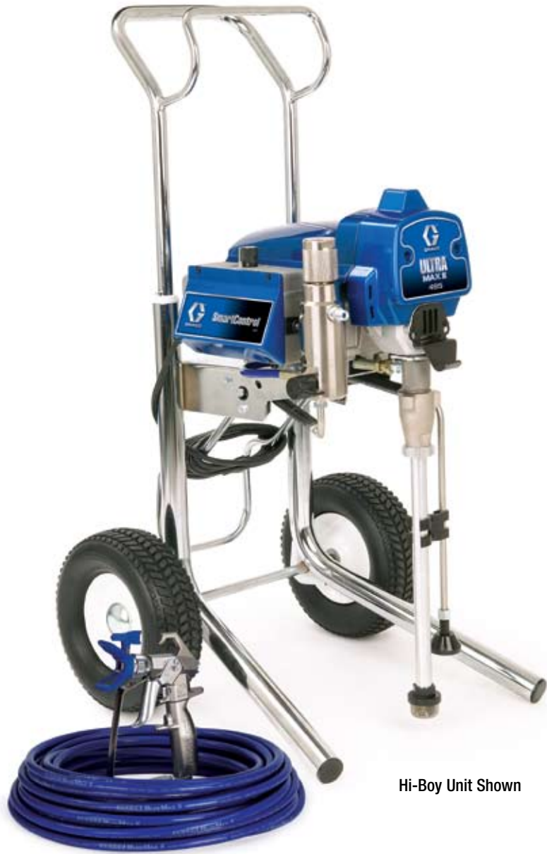
Hi-Boy Unit Shown