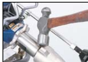
QuikAccess intake requires only a hammer to access the intake ball.

All units include Contractor Gun, 1/4 in x 50 ft BlueMax II Airless Hose, RAC X 517 Tip and Guard. Premium versions include Digital Display, AutoClean2™, and Toolbox.