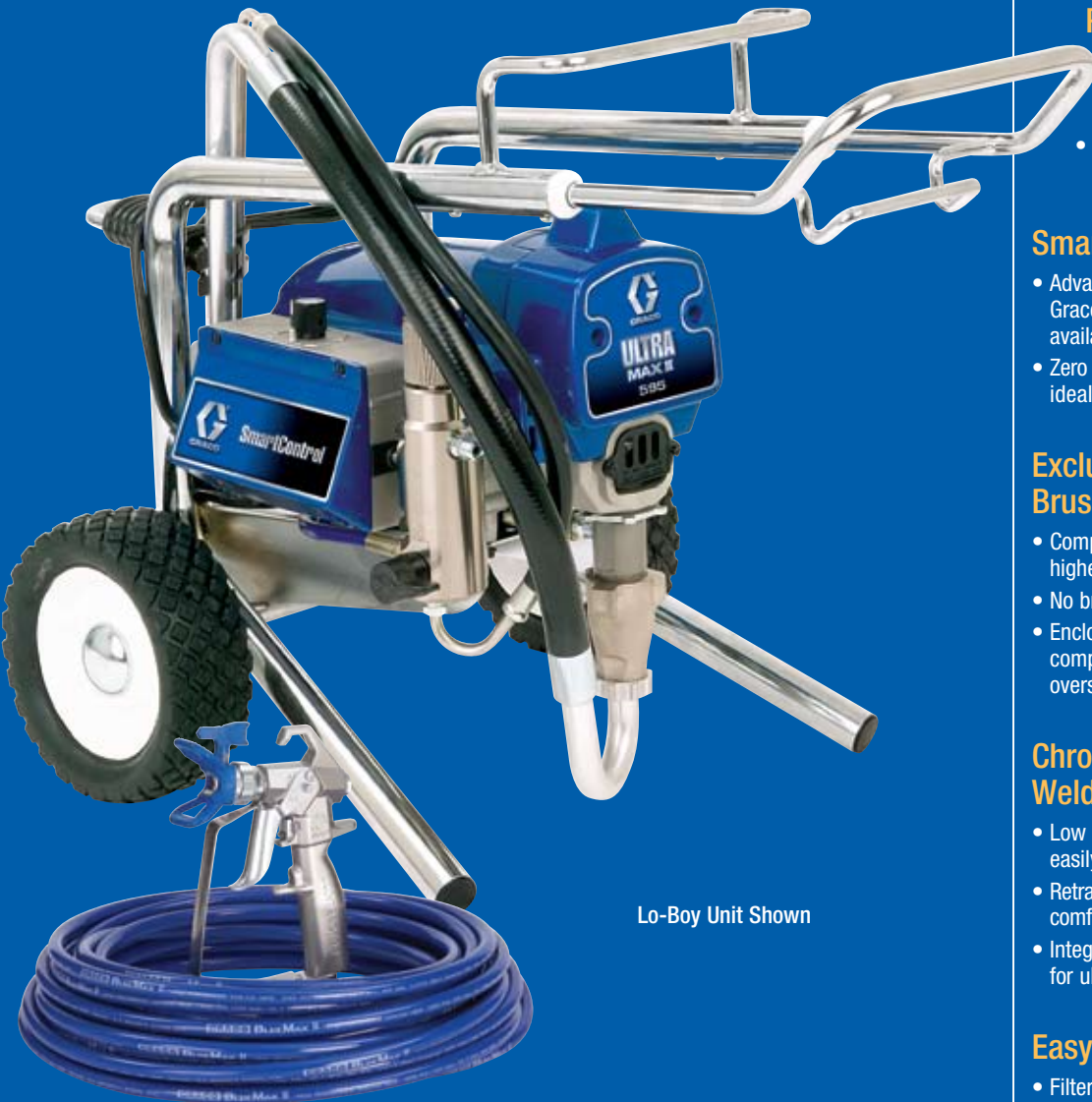
Lo-Boy Unit Shown