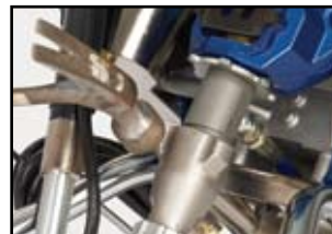
QuikAccess intake requires only a hammer to access the intake ball.