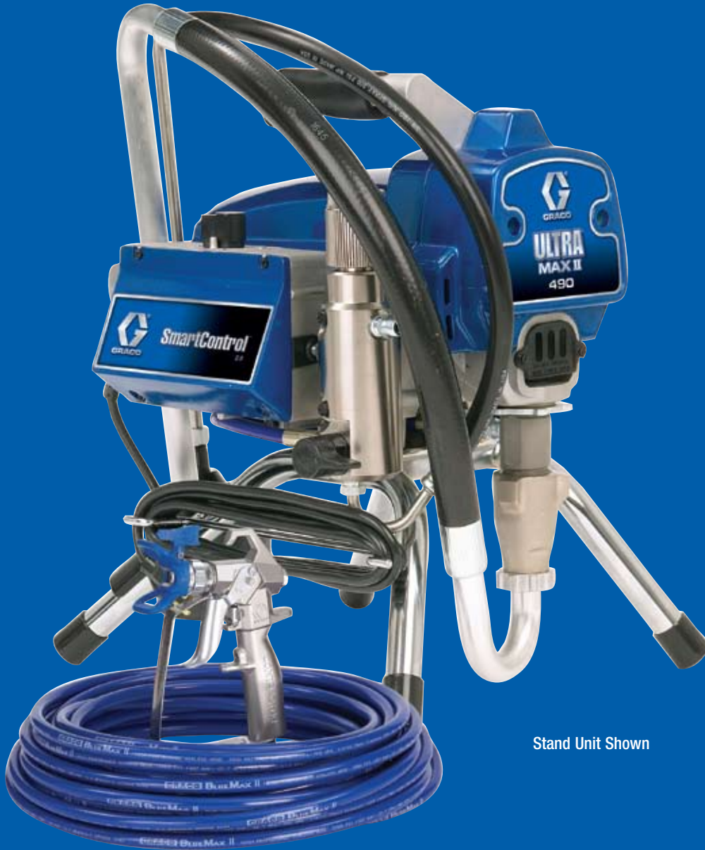
Stand Unit Shown

The new Ultra Max II 490 brings the leading technology and performance of Graco's larger Ultra Max II models into these compact and lightweight sprayers. The 490 is the best choice for professionals looking for superior performance and control for daily use on residential jobs.