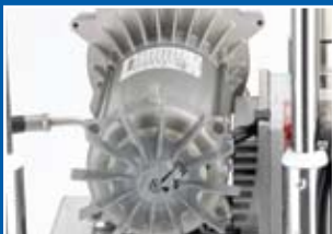
Exclusive ProConnect System - no-tools removal for fast repairs on the job.

All units include Contractor Gun, 1/4 in x 50 ft BlueMax II Airless Hose, RAC X 517 Tip and Guard Premium versions include Digital Display, AutoClean2, and Toolbox.