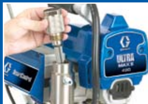
Easy Out filters won't collapse or get stuck when dirty.