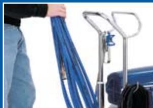
Retractable handle for simple removal of coiled hose.