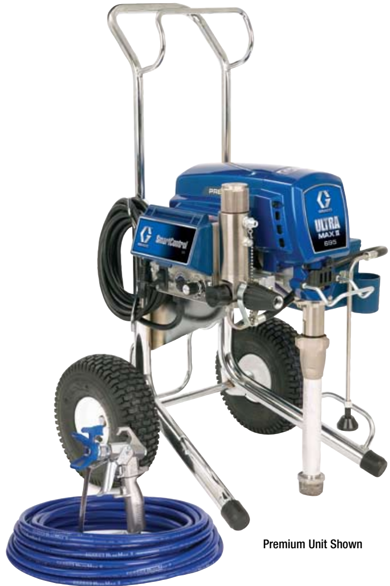
Premium Unit Shown