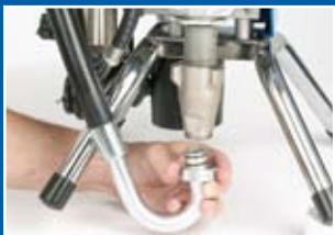
No tools suction hose removal.

Comes complete with: New Contractor Gun, RAC X 517 Tip and Guard, 1/4 in x 50 ft (6.4 mm x 15 m) BlueMax II Hose.