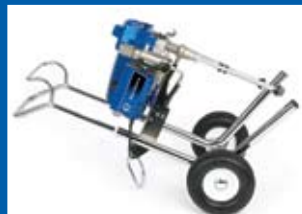
Hi-Boy TiltBack® carts make bucket changes fast and easy.