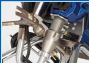
New QuikAccess™ intake requires only a hammer to access the intake ball.