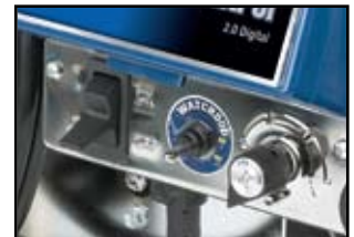
Watchdog Pump Protection System prevents dry pumping damage.