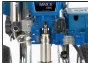
Exclusive ProConnect System - no-tools pump removal for fast repairs on the job.