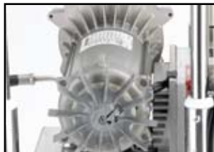
Brushless DC motor with totally enclosed design.

All units include Contractor Gun, 1/4 in x 50 ft BlueMax II Airless Hose, RAC X 517 Tip and Guard. Premium versions include Digital Display, AutoClean2, and Toolbox.