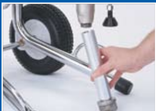
Swivel inlet suction hose.

All units include Contractor Gun, 1/4 in x 50 ft BlueMax II Airless Hose, RAC X 517 Tip and Guard. Premium versions include Digital Display, AutoClean2, and Toolbox.