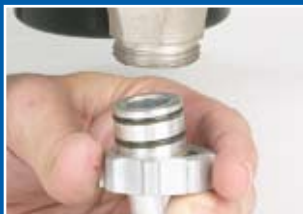
Inlet tube removes by hand for easy clean up.