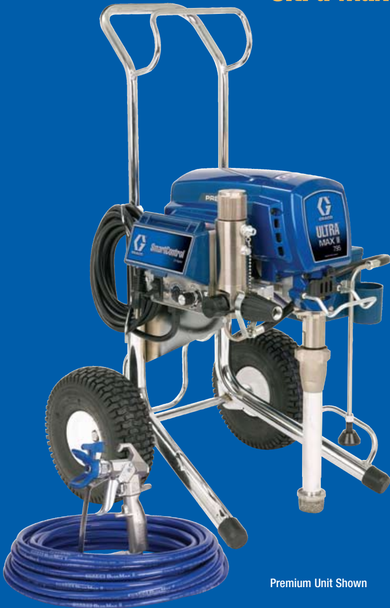
Premium Unit Shown

The Ultra Max II 795 is ideal for one gun and occasional two gun spraying on residential, commercial and industrial jobs. Its higher output delivers consistent performance with larger tips and longer hoses spraying heavier coatings.