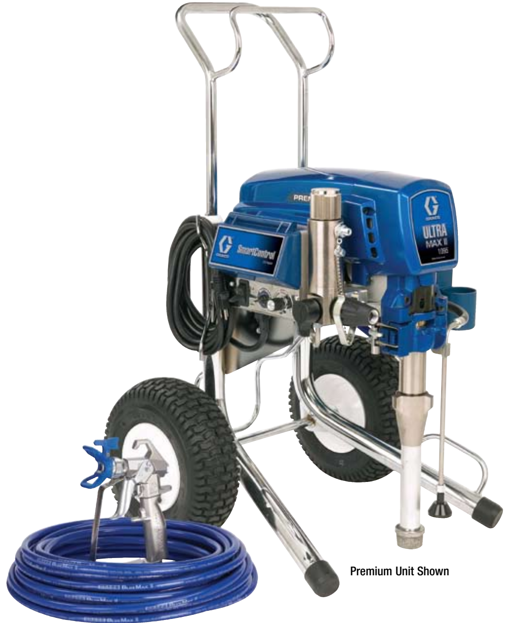
Premium Unit Shown