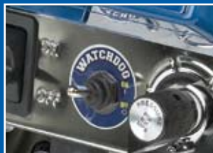
Watchdog Pump Protection System prevents dry pumping damage.