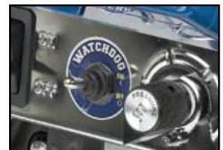
WatchDog Pump Protection System prevents dry pumping damage.