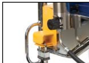
Control Lock Theft Derrtent system

Includes Contractor Gun, 1/4 in x 50 ft and 3/8 in X 50 ft BlueMax II Airless Hose, RAC X 517 Tip and Guard