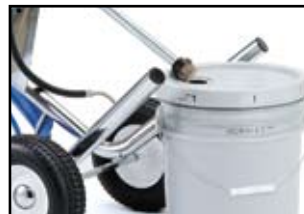
Inlet tubes fit through 2-inch cap on standard 5-gallon buckets.

Comes complete with: New Contractor Gun, RAC X 517 Tip and Guard, 1/4 in x 50 ft (6.4 mm x 15 m) BlueMax II Hose.