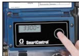
Digital display with pressure readout, job/lifetime counters, and AutoClean2 timer.