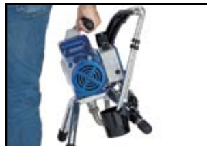
Offset handle for comfortable carrying.

Comes complete with: New Contractor Gun, RAC X 517 Tip and Guard, 1/4 in x 50 ft (6.4 mm x 15 m) BlueMax II Hose.