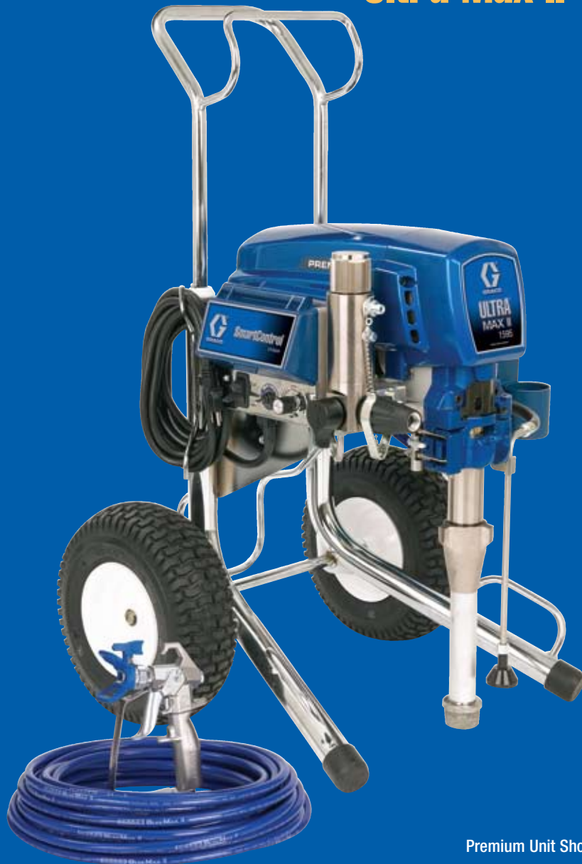
Premium Unit Shown