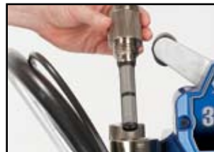
Easy Out pump filter removes simply with the cap.