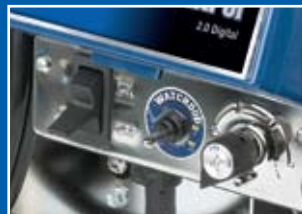
Brushless DC motor with totally enclosed design.