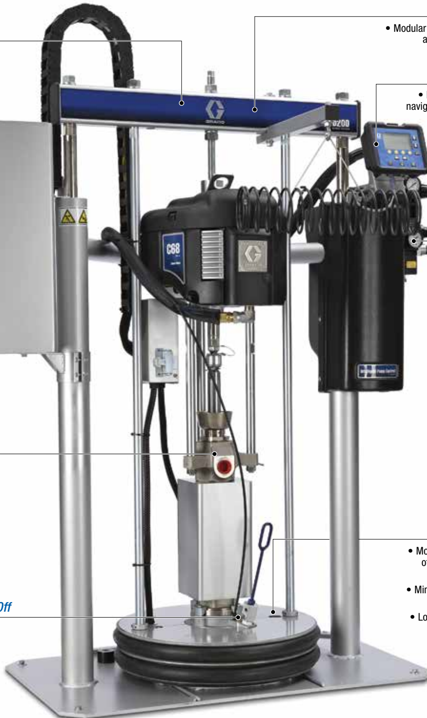
Graco Warm Melt Supply System